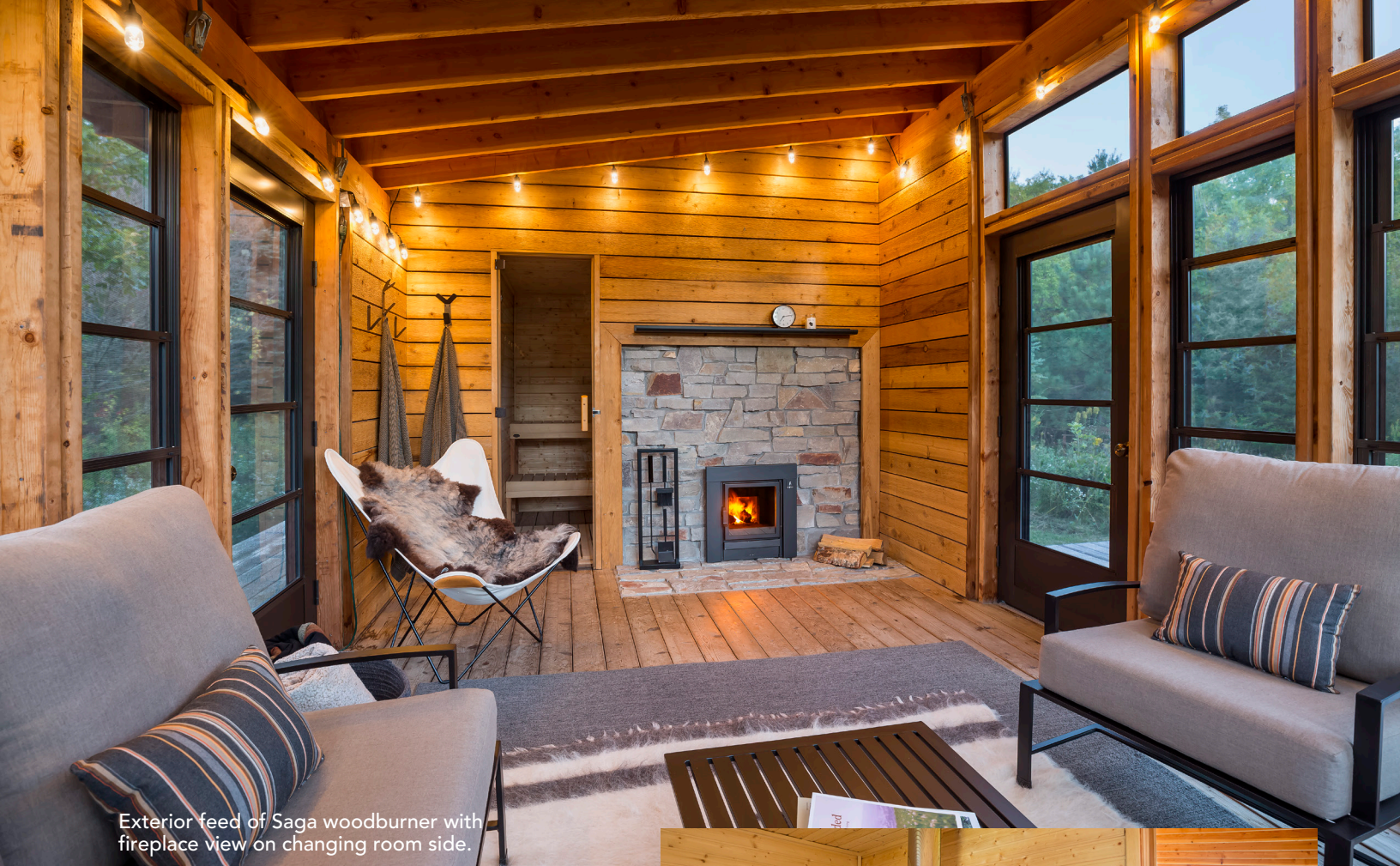
Exterior feed of Saga woodburner with fireplace view on changing room side.

Traditional woodburning saunas really go to the heart of the pure sauna experience: the incomparably soft heat, lush hiss of steam and relaxing crackle of a wood-fueled fire... even the ritual of tending the fire. It is a heritage sauna enthusiasts have treasured for thousands of years. Captured and reinterpreted for modern living in today's Finnleo wood burning heaters.